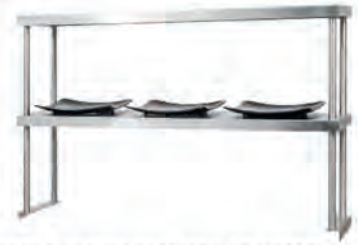
DOUBLE OVERSHELF WITH ADJUSTABLE MIDDLE SHELF

Double overshelf can be used with all prep tables Product code: TDOS-XX-SS